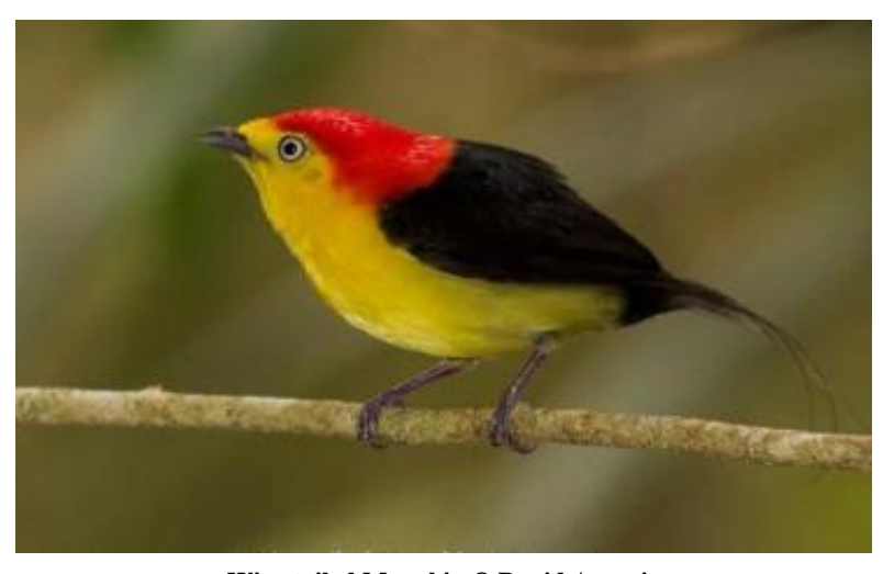
Wire-tailed Manakin © David Ascanio

January 12, Day 3: Drive to Hato La Aurora. An early morning in Casa Cumbres will allow us to enjoy the dawn chorus, an orchestra of birds welcoming the day. Such celebration might include the vocal Speckled Chachalaca and Chestnutfronted Macaws in flight. A pair of Yellowbellied Elaenia might start the day with their unique roaring call notes and the rattle of a Plain-brown Woodcreeper might announce the presence of army ants. With lock, we might encounter Amazonian birds that radiated from the Amazon and include Fulvous-crested Tanager, White-bellied Antbird, Pectoral Sparrow and Little Woodpecker.