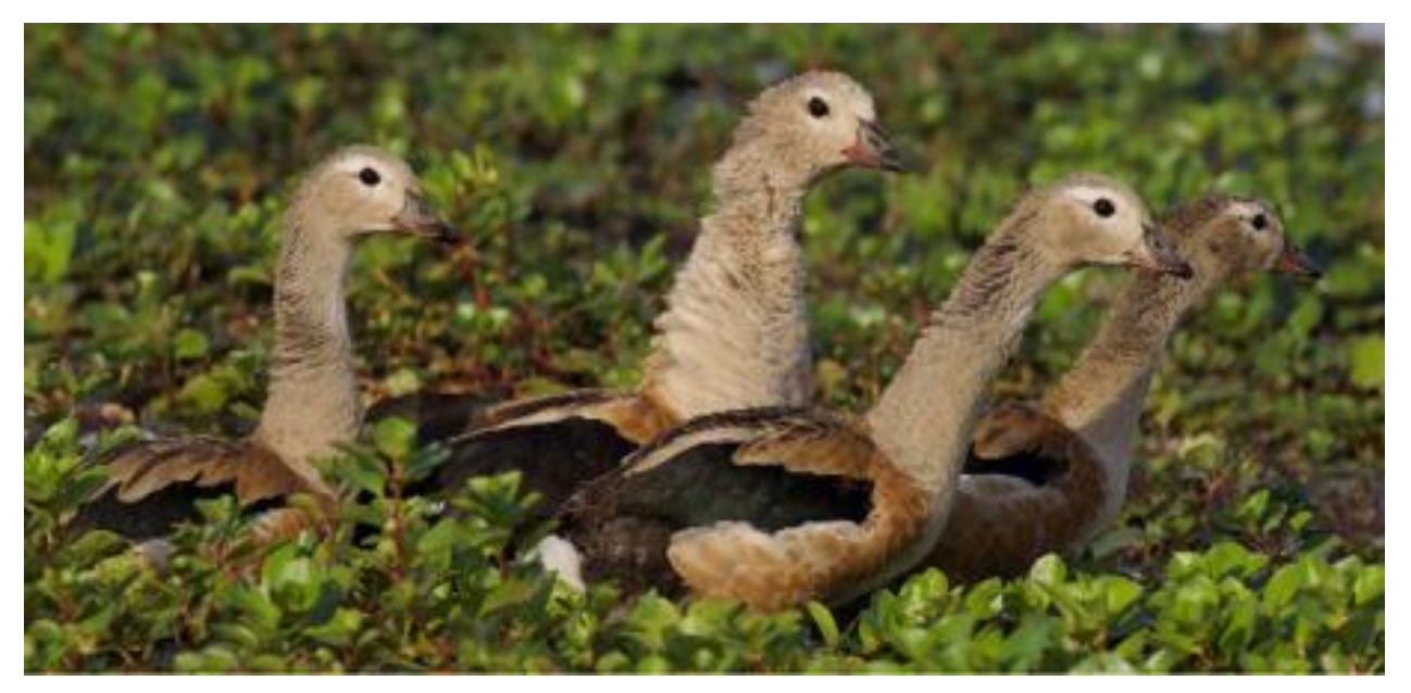
Orinoco Goose