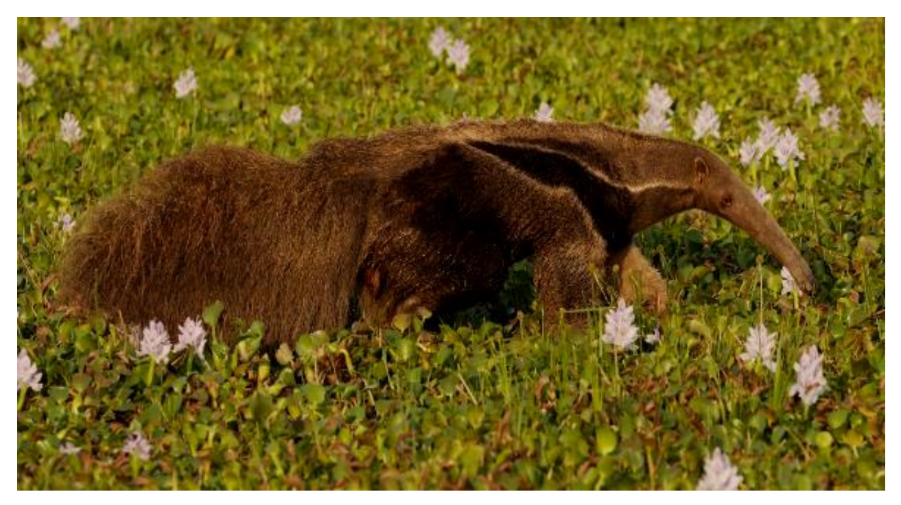
Giant Anteater

Colombia is one of the most bio-diverse countries in the world, with an amazing number of distinctive biomes from high-peak mountains in the Andes to extensive flatlands and Amazonian rainforest. This has made Colombia a dream destination for birders and nature lovers alike. VENT is proud to offer this trip that concentrates on the Llanos (Plains) of the Orinoco, a vast area rich in waterbirds and forest species alike.